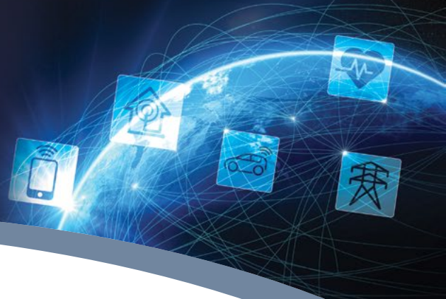
Exhibit at the IOT Global Summit 2014

The National Press Club, Washington, D.C. U.S.A.