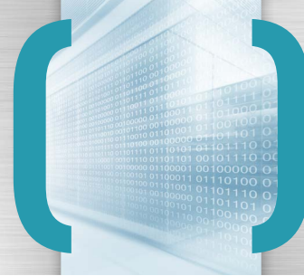
Exhibit at Data Protection 2015

10 December 2015 / The Management Centre Europe Brussels