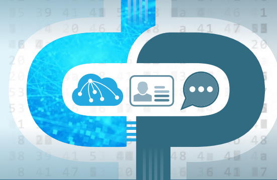
Exhibit at Data Protection 2019