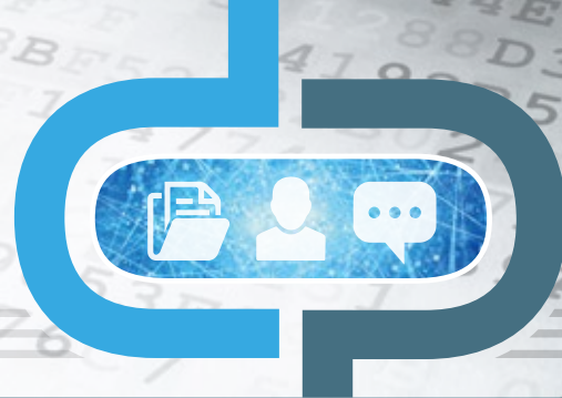
Exhibit at Data Protection 2017