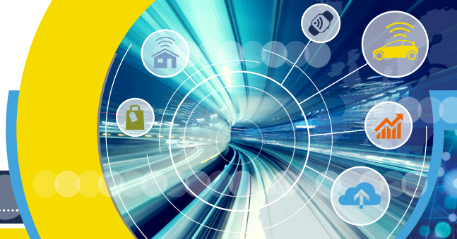
Exhibit at the WWRF 5GHuddle