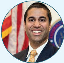
Ajit Pai Chairman FCC

Speakers and delegates at recent events included: