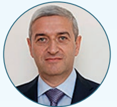
H.E Vahan Martirosyan Minister of Transport Communication and IT of Armenia MTCIT