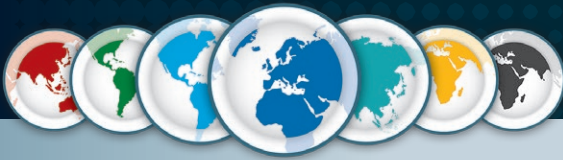
Exhibit at THE GLOBAL SPECTRUM SERIES

Discounts available for multi event packages