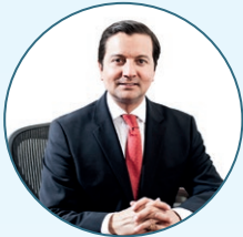
David Luna Sánchez ICT Minister Government of Colombia