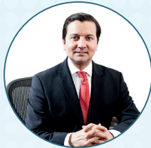
David Luna Sánchez ICT Minister Government of Colombia