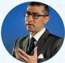
Rajeev Suri CEO Nokia