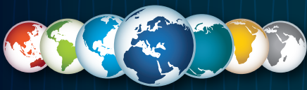
Exhibit at Global Spectrum Series

Discounts available for multi event packages