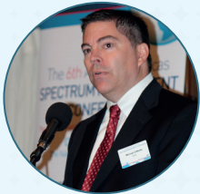
Michael O'Rielly Commissioner FCC

Speakers and delegates at last year's events included: