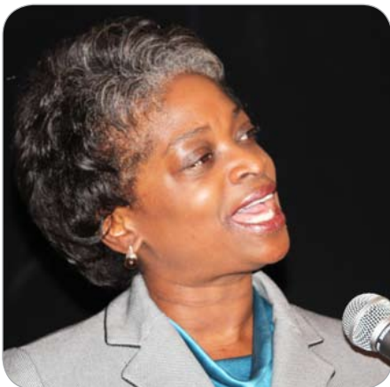
Mignon Clyburn Commissioner, FCC