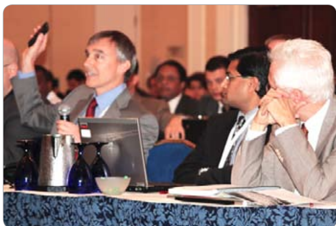
Questions from the floor