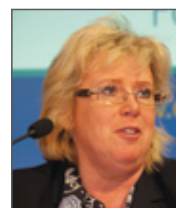
Lena Ek MEP, European Parliament