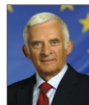
Jerzy Buzek Member, European Parliament