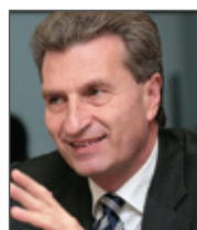
Günther Oettinger Commissioner for Energy, European Commission